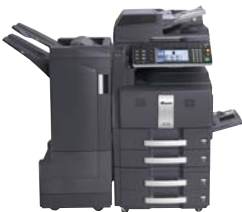
Shown with Optional DSDP, 500 x 2 Tray, and 3,000 Sheet Finisher 50.9" W x 26.8" D x 48.8" H