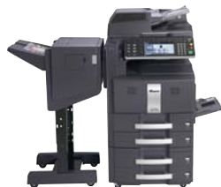
Shown with Optional DSDP, 500 x 2 Tray, and 1,000 Sheet Finisher 48.8" W x 26.8" D x 48.8" H